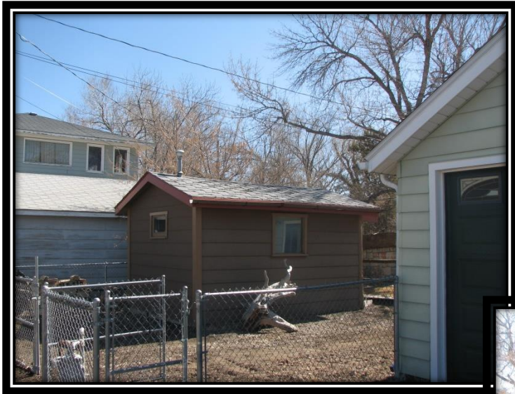
Man Cave or Play House