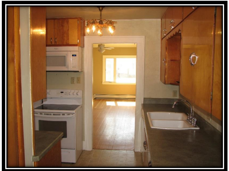
Looking into Dining Room