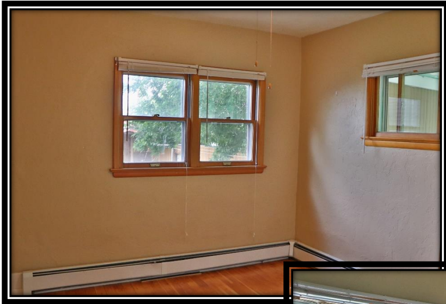
Bedrooms On Main Level