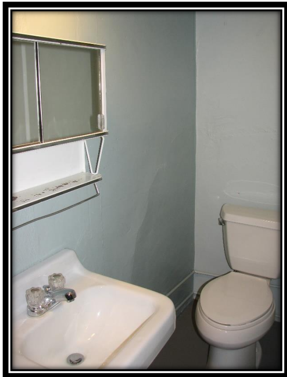
Bath in Basement