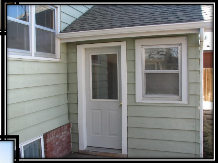
With Outside Entrance