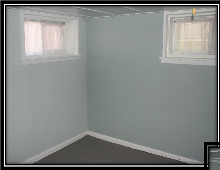
Room in Basement No Legal Egress