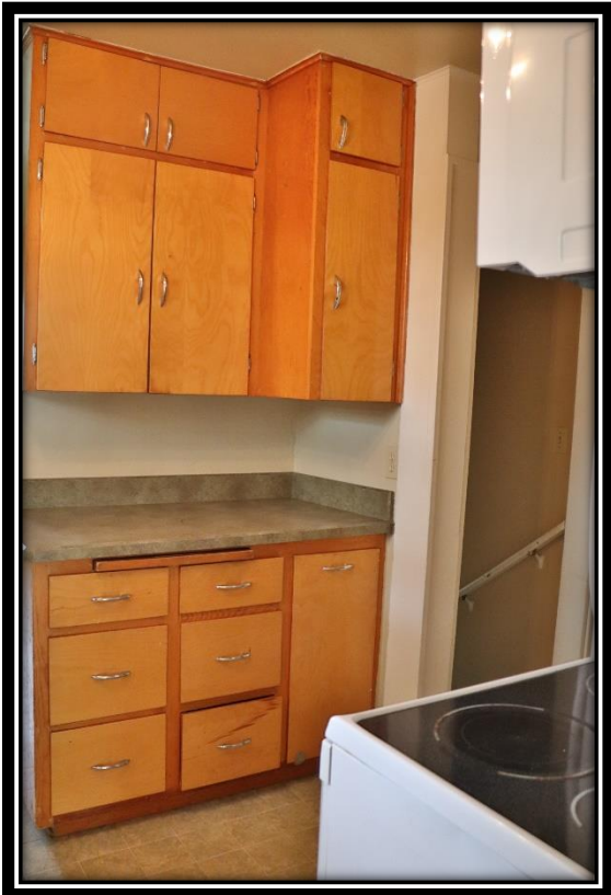
Doorway to Basement